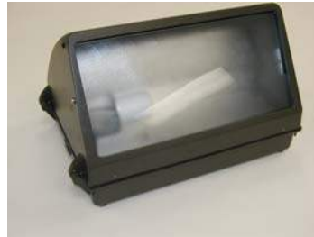
Med. Wall Pack DC150 Cut Off