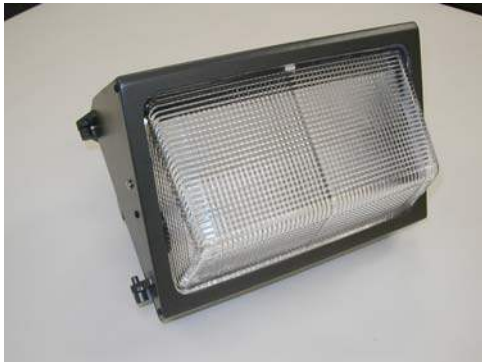
Medium Wall Pack DC 150