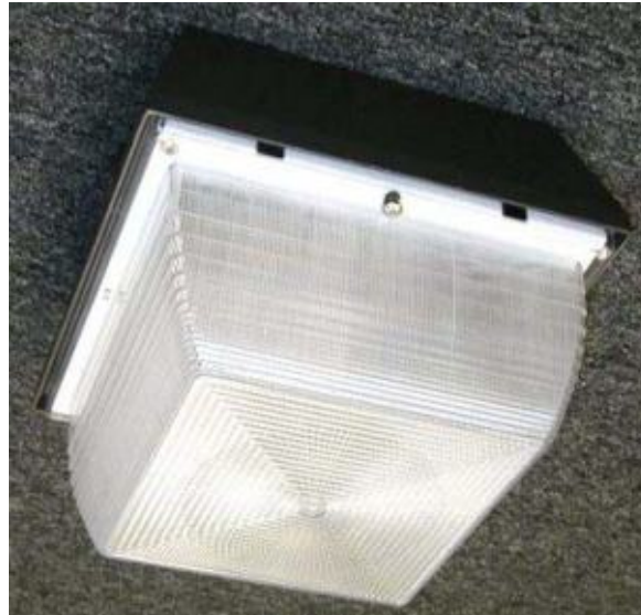
CV300 Series 12" x 12"